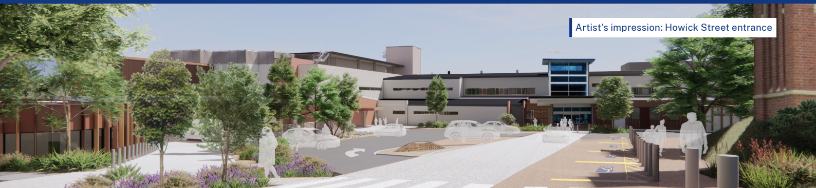
Artist's impression: Howick Street entrance