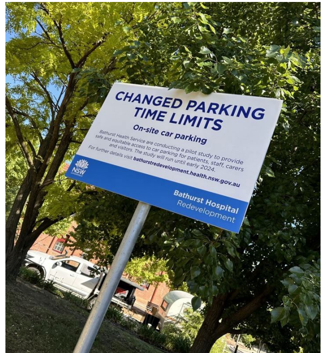
Above: Car parking signage for the new on-site timed parked trial.

There are no changes to other car parking zones on the hospital site. Access to the hospital including improved car parking, accessibility for patients, staff and visitors, alongside pedestrian and vehicular flows on the campus are under extensive review to support the current operations and future redevelopment in accordance with statutory planning requirements.