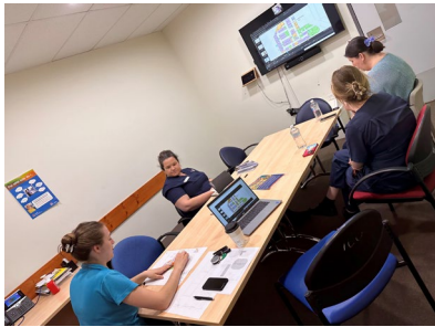
Above: Staff participating in Project User Groups