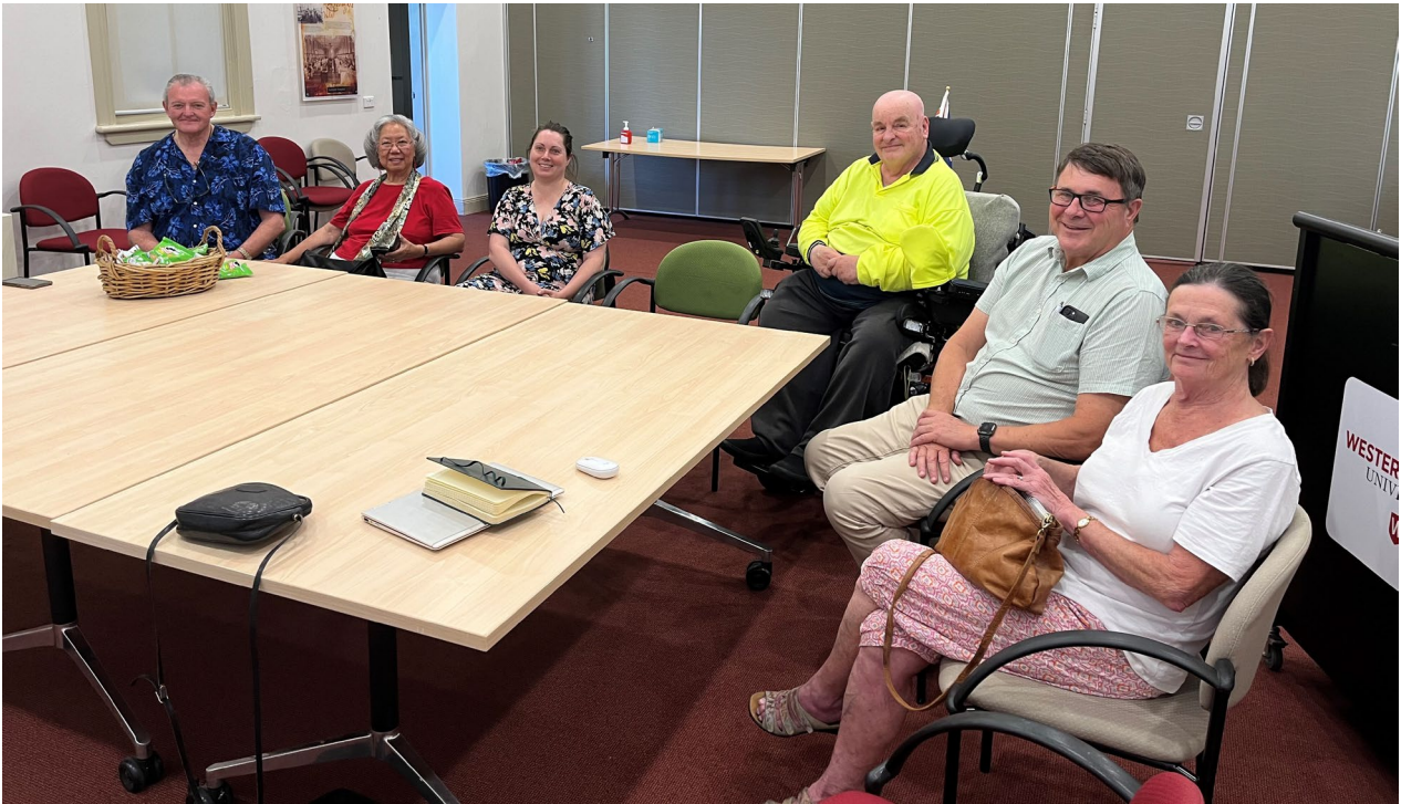
Above: Members of the Community Reference Group at the December 2023 meeting.