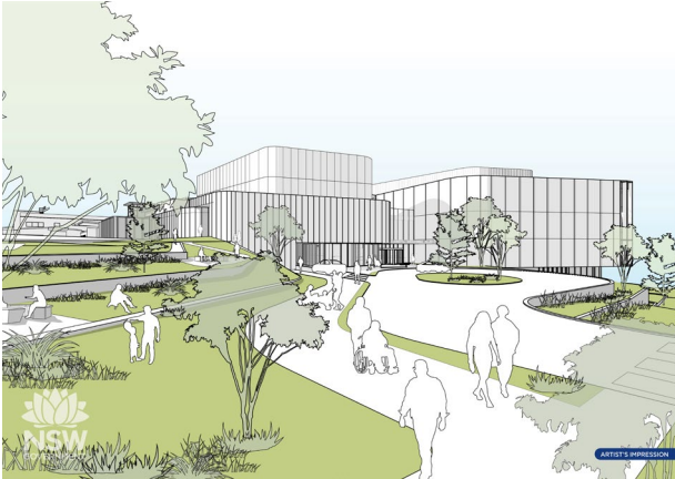
Above: Concept Design artist impression released for community consultation in August 2023.

The $200 million Bathurst Hospital Redevelopment will deliver a mix of new and refurbished areas including an expanded emergency department and maternity unit alongside a new modern mental health inpatient unit (Panorama House), improvements to inpatient, outpatient and community health services, operating theatres and a new integrated paediatrics zone. Daffodil Cottage will also be expanded as part of the redevelopment. The redevelopment will include a new main entry from Mitre Street, alongside indoor and outdoor greenspace. This year the project has undertaken the following: