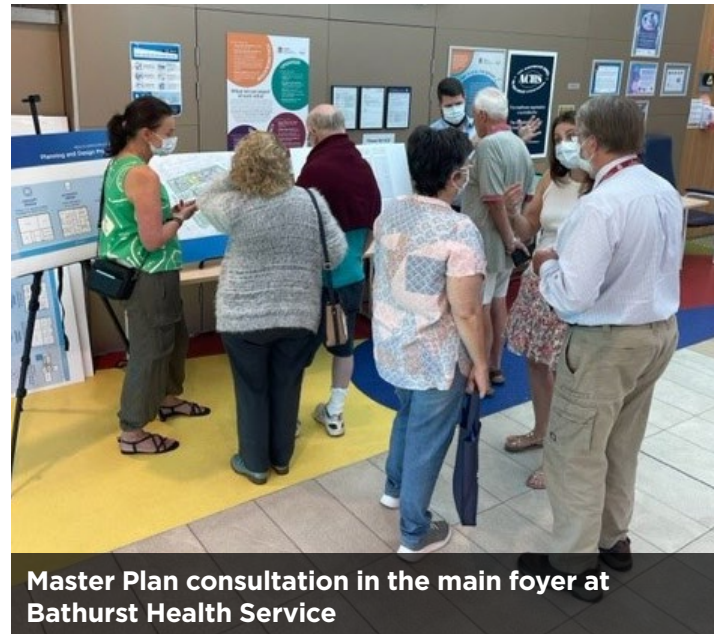
Master Plan consultation in the main foyer at Bathurst Health Service